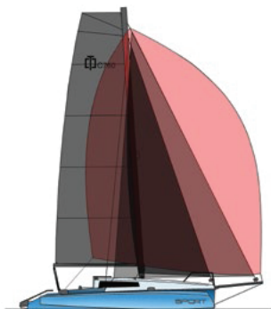
CORSAIR 760 Sport